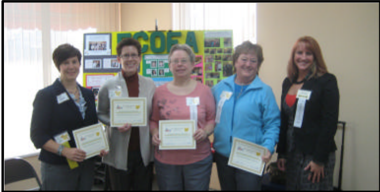
ABOVE LEFT: ECOEA Public Relations Grants were awarded to 8 ECOEA Locals... Among them present to accept were Newcomerstown, Wooster, Perry, North Canton, Fairless, and Malvern. Awards also went to Alliance and Triway... ABOVE RIGHT: Locals receiving FCPE awards for being a top 10 ECOEA Local in membership participation in the OEA Fund For Children and Public Education for the 2011-12 school year.