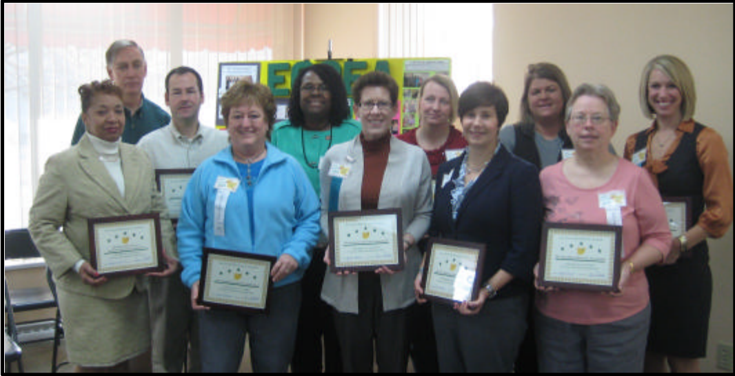
LEFT: Perry Classroom Teachers Association was the winner of the $500 award in the Five Star Local lottery drawing... PCTA President was on hand to accept the award...