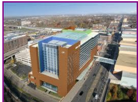
Conference will be held at the new Columbus Hilton Downtown

ECOEA provides a scholarship opportunity for our Local Associations who send one or more members to this Collective Bargaining Conference... Information and an online application can be found on the ECOEA website www.ecoea.ohea.us